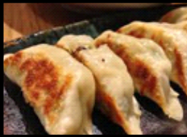
Deep Fried (or steamed) Pork Dumpling