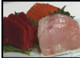
2 Yellowtail, 2 Salmon, 2 Tuna