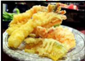
2 Shrimp Tempura, 4 Vegetable Tempura