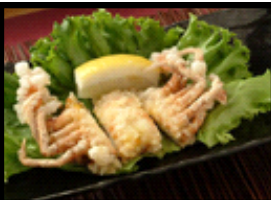
Deep Fried Soft Shell Crab with mixed Green Salad