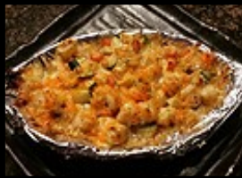
Baked Scallop with carrots, mushrooms topped with the House Mayo Sauce