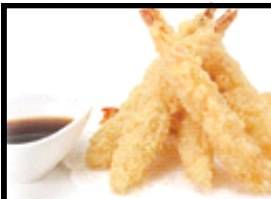
5 Pieces of Shrimp Tempura