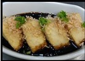
Fried Tofu with Fish Flakes, Green Onions, Tempura Sauce