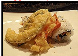
5 Pieces of Vegetable Tempura