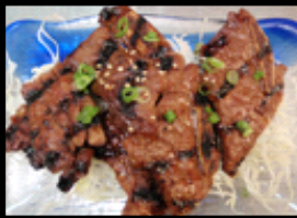
Marinated Beef Rib