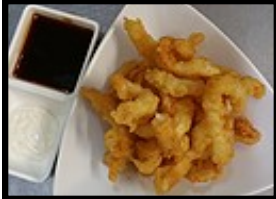
Deep Fried Calamari with Teriyaki sauce and creamy sauce