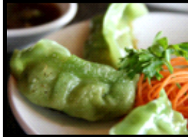
Deep Fried (or steamed) Vegetable Dumpling