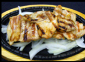
Grilled Chicken Breast with Teriyaki Sauce