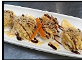
Mushroom and Spicy Tuna deep fried