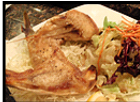
Baked Yellowtail Collar