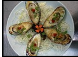
Baked Green Mussel with Sweet Mayo