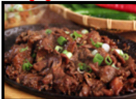
Pan Fried Marinated Beef