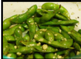
Sautéed Soybeans with Garlic