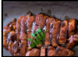
2 Tuna, 2 Salmon and 2 Yellowtail