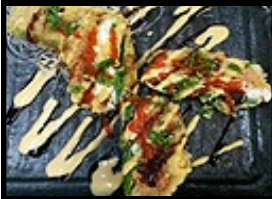
Jalapeno, Cream Cheese, Spicy Tuna, deep fried