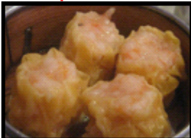
Deep Fried (or steamed) Shrimp Dumpling