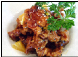
Deep Fried Chicken with Sesame and Teriyaki sauce