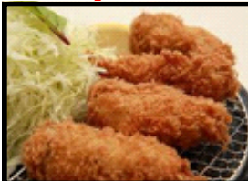
Deep Fired Oyster with Katsu Sauce