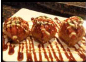
Fried Crispy Rice topped with Spicy Tuna and Jalapeno